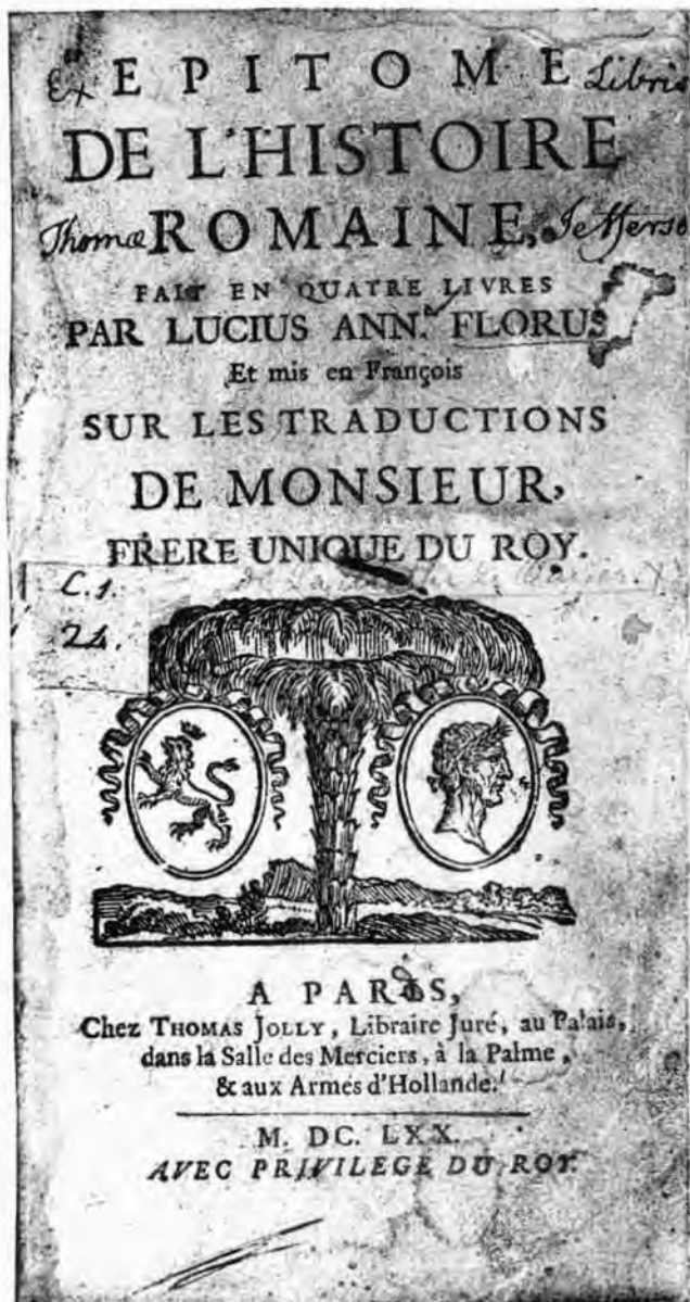
Plate IV. The Shadwell Ex Libris, unerased. The Inventory Shelf Label is at the upper left of the ornament. Sowerby 63, now in the Library of Congress.