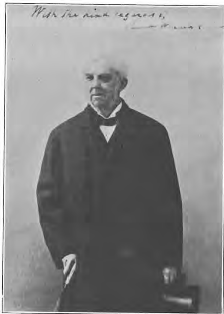
OLIVER WENDELL HOLMES