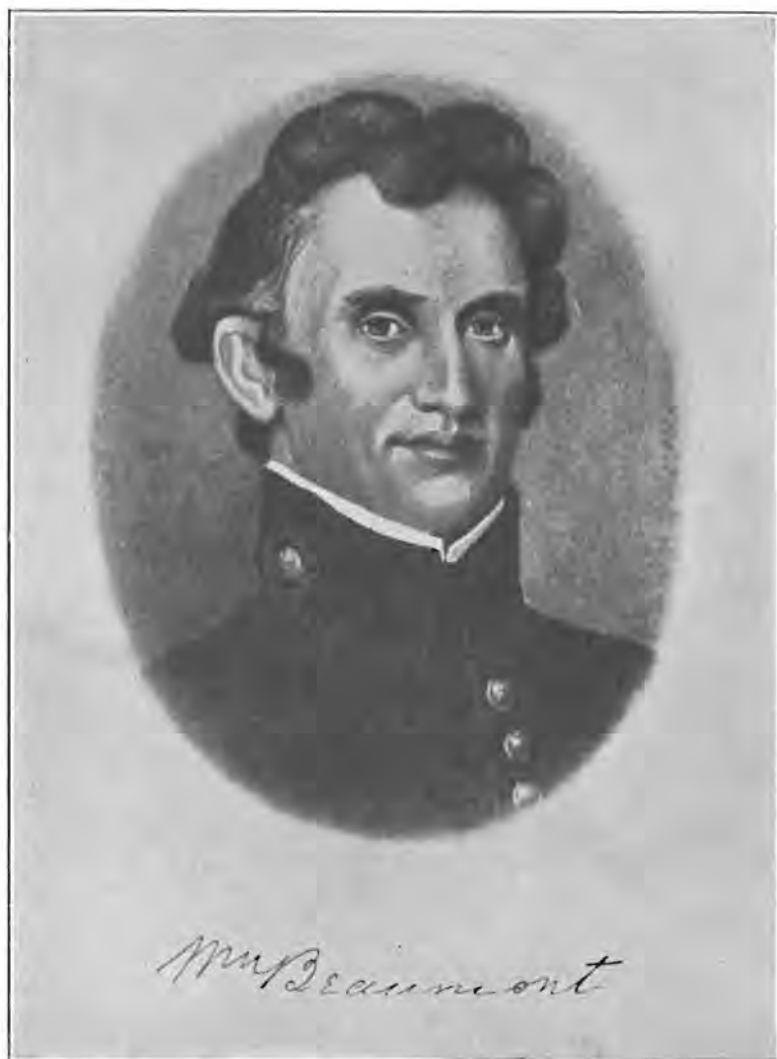
[ITEM NUMBER 10]