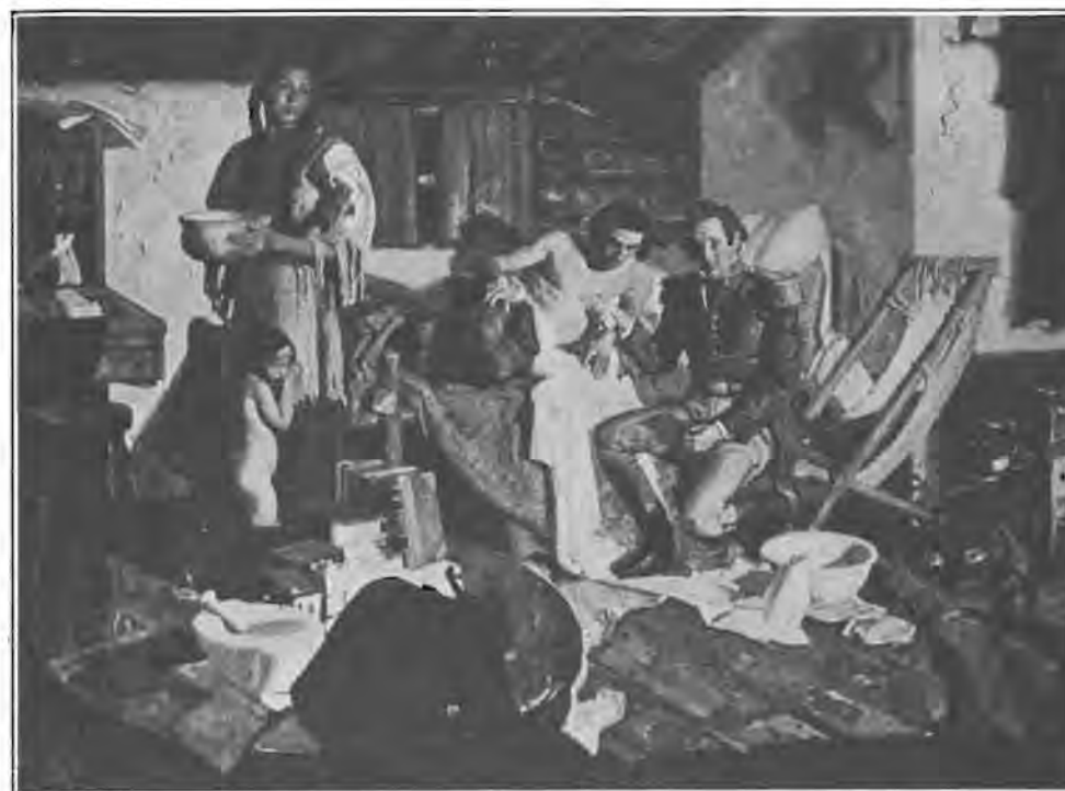
BEAUMONT AND ST. MARTIN