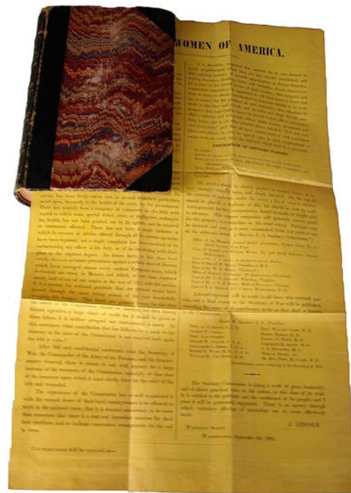
This rare broadside, titled “To the Loyal Women of America,” is signed in the text by Abraham Lincoln (at lower right)