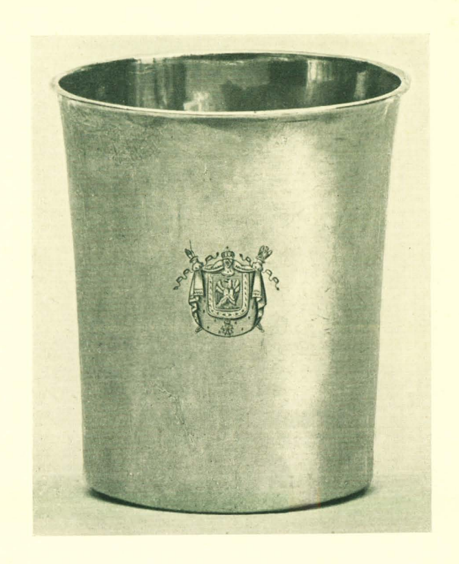
Napoleon I. His silver cup, used by him in his dying moments. Engraved with Imperial Coat of Arms. (From Vignali Collection of Napoleon Relics).